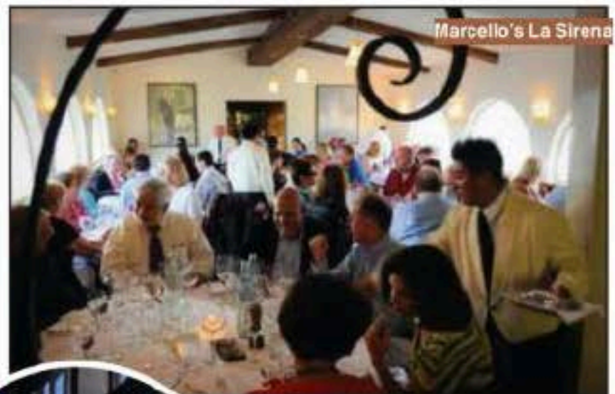
Marcello's La Sirena

The building looks as if it once housed a fast food joint. (It didn't). Once inside the tight dining room, the team of expert servers in white jackets plus the magic from the kitchen will remind you why we go to restaurants in the first place.