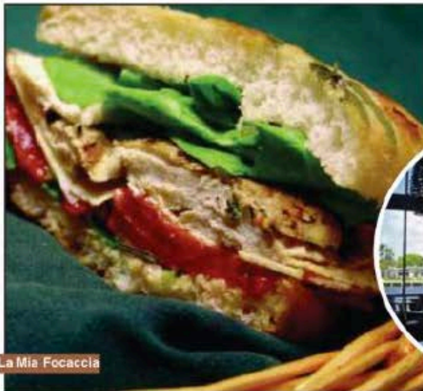
La Mia Focaccia

Chiara Trocchia's sandwiches start with her fresh bread rounds, which are filled with such made-in-house ingredients as grilled eggplant, roasted red peppers and chicken marinated in the fresh herbs she grows out back. Sandwiches don't get any fresher.